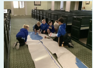
Bassenthwaite— Christmas Experience

Check out some of the other galleries showing the children learning and exploring a range of different topics. Check out your child's class page here.