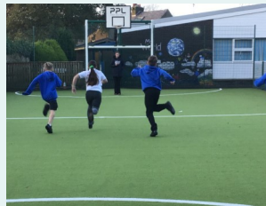
Derwentwater—A French Beast!