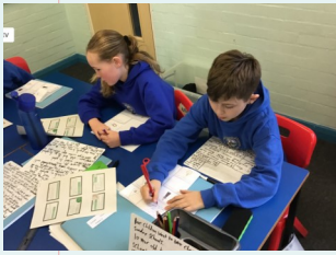
Ullswater Victorians Schools

Here are links to some activities which have been happening in school this week (click on pictures) -