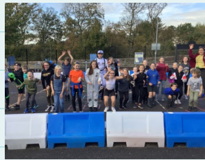
Lunchtime Helpers & Craze It Crew