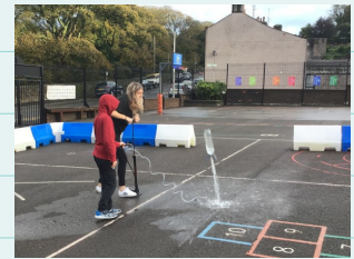
Ullswater Space Day

Check out some of the other galleries (especially all the amazing artwork sessions and Space Day this week!) showing the children learning and exploring a range of different topics. Check out your child's class page here.