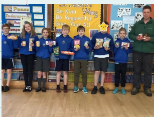
Harvest Festival Food Bank Collection

Here are links to some activities which have been happening in school this week (click on pictures) -