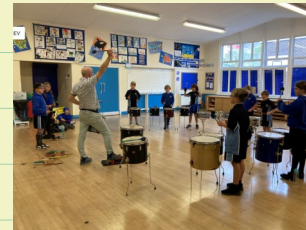
STIX Percussion Club

Check out some of the other galleries showing the children learning and exploring a range of different topics. Check out your child's class page here.