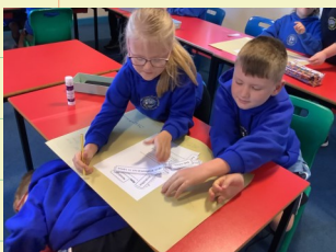
Buttermere –Writing Instruction Texts

Here are links to some activities which have been happening in school this week (click on pictures) -