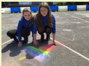
Craze It—Draw It!

Here are links to some activities which have been happening in school this week (click on pictures) -