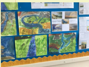
Year 5 William Turner Art

Here are links to some activities which have been happening in school this week (click on pictures) -