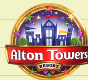
Yr6 Residential & more to come...

Check out some of the other galleries showing the children learning and exploring a range of different topics. Check out your child's class page here.