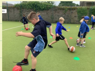
Class 4 PE Invaders