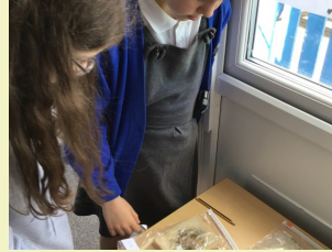
Can we grow life? Yes we can!