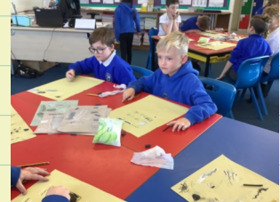
Class 4 Mark Making with Charcoal

Check out some of the other galleries showing the children learning and exploring a range of different topics. Check out your child's class page here.