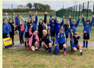
Year 3/4 Football at St Benedicts