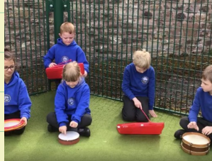
Class 5—Music Inspired by Hans Zimmer