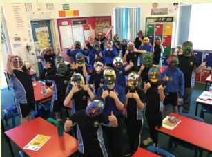
Class 3 Mayan Masks!

Here are links to some activities which have been happening in school this week (click on pictures) -