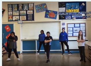
Class 1 Street Dance