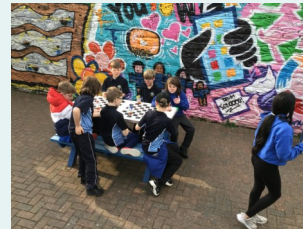
Year 6 Science Club

Check out some of the other galleries showing the children learning and exploring a range of different topics. Check out your child's class page here.