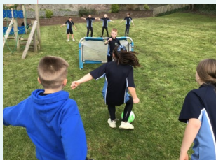
Class 5 Football Circuit Training

Here are links to some activities which have been happening in school this week (click on pictures) -