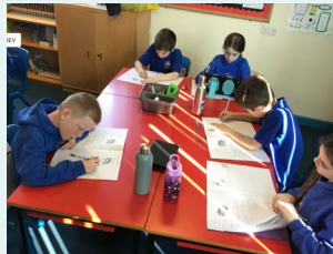
Class 6 Non-chronological reporting