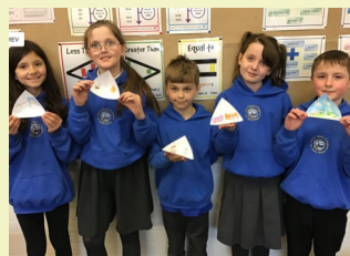
French Shops & French Food