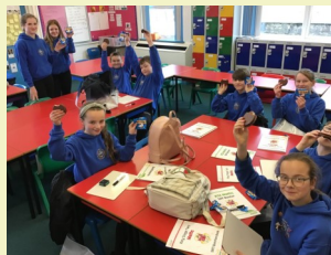
Year 6 Maths Club Wagon Wheels!