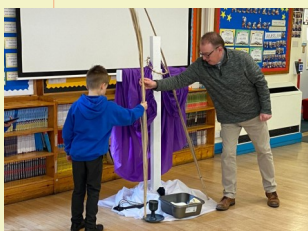
Collective Worship— Symbols of Easter

Here are links to some activities which have been happening in school this week (click on pictures) -