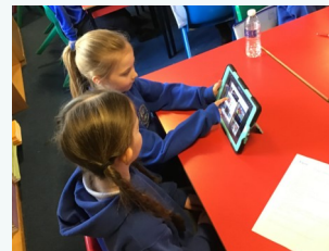
Class 6 Creating Websites

Check out some of the other galleries showing the children learning and exploring a range of different topics. Check out your child's class page here.