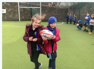
Class 4 Rugby Skills