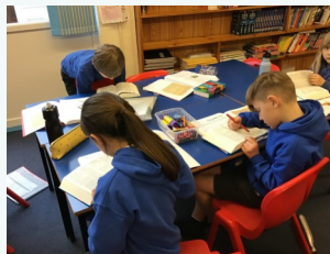
Our Christian Value of Forgiveness