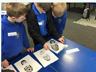
Science Club—Crime Scene Investigation

Here are links to some activities which have been happening in school this week (click on pictures) -