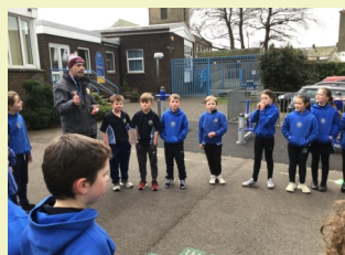
Class 5 Whitehaven Sharks