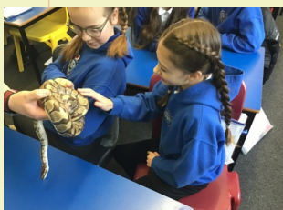
Class 2 Zoolab Experience

Here are links to some activities which have been happening in school this week (click on pictures) -