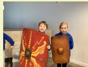
Class 4 visiting The Beacon

Check out some of the other galleries showing the children learning and exploring a range of different topics. Check out your child's class page here.