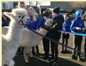
Year 5 & 6 Alpaca Visit