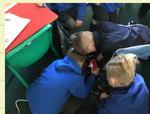
Class 3 'Let there be light'