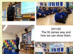
Upper School Collective Worship