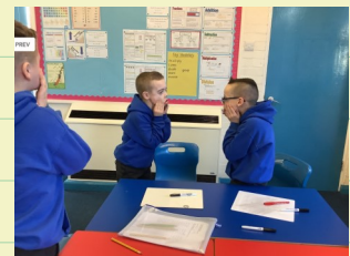
Class 4—Shadows and reflections

Check out some of the other galleries showing the children learning and exploring a range of different topics.