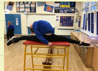
Some of the uppers showing of their gymnastics skills this week!

Check out some of the other galleries showing the children learning and exploring a range of different topics. Check out your child's class page here.