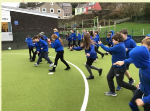
Year 5—Role playing for writing

Here are links to some activities which have been happening in school this week (click on pictures) -