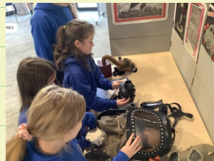
Class 2 visiting the Beacon