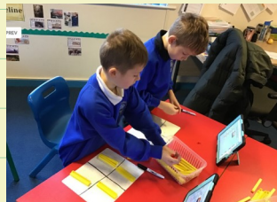
Year 3—Investigating Division