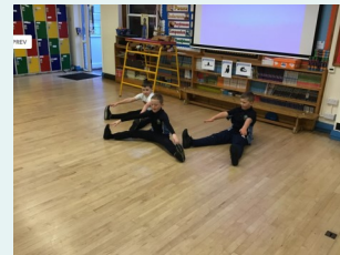
More gymnastics from Class 6

Check out some of the other galleries showing the children learning and exploring a range of different topics. Check out your child's class page here.