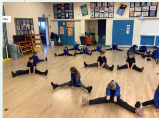
Class 4 doing some gymnastics

Here are links to some activities which have been happening in school this week (click on pictures) -