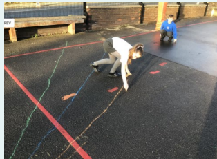
Class 5 measuring shadows outside