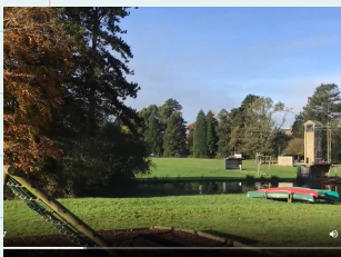
Year 5 Winmarleigh Residential Montage!

Here are links to some activities which have been happening in school this week (click on pictures) -