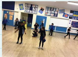
Class 6 dancing the Charleston...