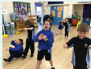
Class 5 also putting on their dancing shoes!