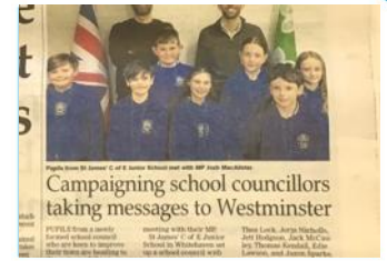
Whitehaven News Link !

Campaning school councillors taking messages to Westminster