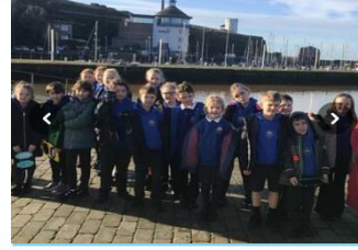
Out & About....