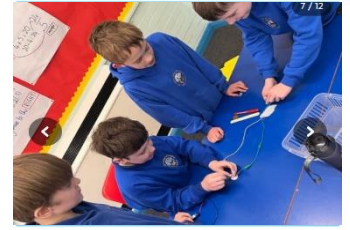
Conductors or Insulators ?

Hello and welcome to our weekly newsletter.