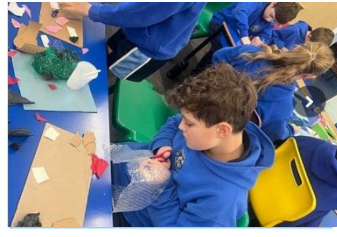
Printing blocks - Ullswater