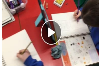
Retrofuturism - Derwentwater

We have had a great week of learning and activities this week. Check out Class Dojo for lots of updates and photos.