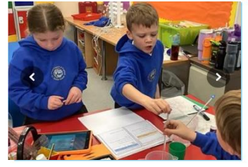
Testing Temperatures - Bassentwaite

Hello and welcome to our weekly newsletter. This week Windermere Class have been out every afternoon for their intensive weekly swimming block. Reports from staff have been excellent, with great effort and respect being shown, and everyone has developed their confidence - whatever their starting point. Next week Ullswater will be having their block, and Derwentwater the week after. Staff have been out and about this week too, visiting other local schools and meeting with other colleagues to support our teaching and delivery of maths and writing. We have also had groups of children out exploring forests, playing basketball at The Whitehaven Academy and competing in girls football tournaments in Workington. As always, our children behaved really well and did our school proud. A special congratulations for the girl's football team who won their event in a closely contested final, on penalties, to bring home a new trophy for our cabinet. Well done everyone.