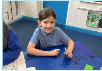
Bassenthwaite Science ClassDojo