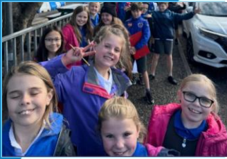
Windermere in Whitehaven – ClassDojo

Here are links to some activities which have been happening in school this week (click on pictures) Check out all of the other galleries showing the children learning and exploring a range of different topics. Check out your child's Dojo for more photos