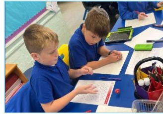
Ullswater Maths ClassDojo