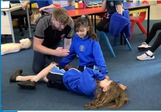
Bassenthwaite First Aid

Here are links to some activities which have been happening in school this week (click on pictures) Check out all of the other galleries showing the children learning and exploring a range of different topics. Check out your child's class page here.