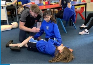
Bassenthwaite First Aid

Here are links to some activities which have been happening in school this week (click on pictures) Check out all of the other galleries showing the children learning and exploring a range of different topics. Check out your child's class page here.