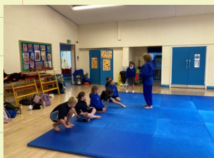
Breakfast Judo Club

Here are links to some activities which have been happening in school this week (click on pictures) -