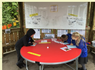
Our Prayer Space