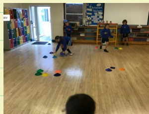
Class 5 'Aiming for a target'