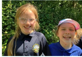
Bassenthwaite Geography Fieldwork