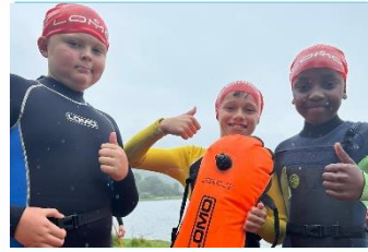
Wild Swim Group 3