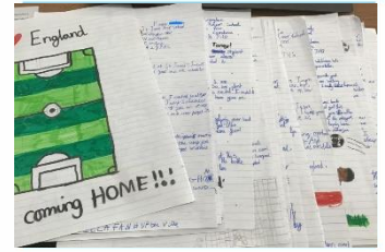
Derwentwater Letters to Downing St & England

SPORTS DAY - Next week we will be welcoming parents down to our annual sports day event held at the County Ground, home of Whitehaven Amateurs FC. Children will work on various sports events in the morning including field events and football and then will round off the day with some exciting track events. As always, it's great to have the parents cheering us on so hopefully we will see you there – Parents are invited from 1 p.m. Parking is allowed by the club although is limited so may need to navigate drivers to park further afield and we encourage people to walk if possible. We estimate to be finished at 2.45 p.m. and parents are free to take their children following the event. We will walk the remaining children back up to school for normal time collection or inclusion in after-school club if needed. Children should bring a packed lunch for the day, water and protection from the sun and rain or whatever the weather throws at us. All children have been allocated their house team/colour and we ask that children wear a top in that colour. If this is tricky, don't worry we can provide bibs to keep everyone in their team colours.