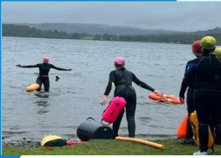
Yr 6 Water Safety Group 1

Here are links to some activities which have been happening in school this week (click on pictures) Check out all of the other galleries showing the children learning and exploring a range of different topics. Check out your child's class page here.