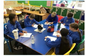
Ullswater Move Up Day

SPORTS DAY - This year we will again hosting our annual school sports day down at the home of Whitehaven Amateurs AFC on Monday 15 th July. The children will be there all day and so all children will need a packed lunch. In the morning we will be organising field events and even a mini football tournament and we then invite parents and families to join us for the exciting track events from 1 p.m. Points from all 3 sessions will be combined to announce an overall winner. You will have received a text today of the house team that your child will represent. This will be the same as previous for most older pupils (unless we needed to balance teams due to children leaving us) and all Yr 3s will be allocated to their house for the first time. If children can please wear a top in that colour (we have spare bibs for children to wear if not). Children can be taken directly after the final event from Whitehaven Amateurs at approximately 2.50 p.m. Or for those parents not able to attend, we will walk the children back up to school where they can be collected at normal time (or attend afterschool club if needed).