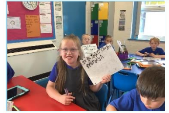
Bassenthwaite Computational Thinking

SPORTS DAY - This year we will again be hosting our annual school sports day down at the home of Whitehaven Amateurs AFC on Monday 15 th July. The children will be there all day and so all children will need a packed lunch. In the morning we will be organising field events and even a mini football tournament and we then invite parents and families to join us for the exciting track events from 1 p.m. Points from all 3 sessions will be combined to announce an overall winner. You will have received a text today of the house team that your child will represent. This will be the same as previous for most older pupils (unless we needed to balance teams due to children leaving us) and all Yr 3s will be allocated to their house for the first time. If children can please wear a top in that colour (we have spare bibs for children to wear if not). Children can be taken directly after the final event from Whitehaven Amateurs at approximately 2.50 p.m. Or for those parents not able to attend, we will walk the children back up to school where they can be collected at normal time (or attend afterschool club if needed).