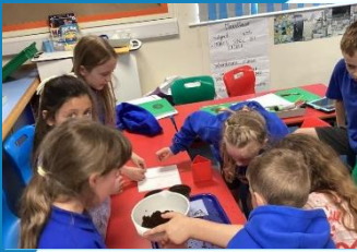
Buttermere Growing Plants

Here are links to some activities which have been happening in school this week (click on pictures) Check out all of the other galleries showing the children learning and exploring a range of different topics. Check out your child's class page here.