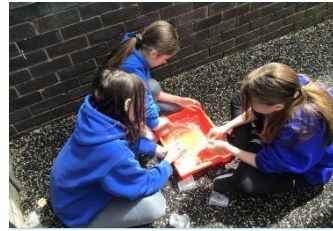
Ullswater Forming Fossils