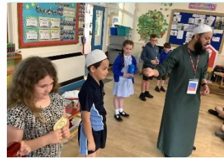
Islam Guest Speaker