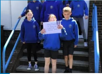
Letters to the Prime Minister

Here are links to some activities which have been happening in school this week (click on pictures) Check out all of the other galleries showing the children learning and exploring a range of different topics. Check out your child's class page here.