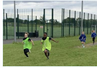
Cross Country Round 2