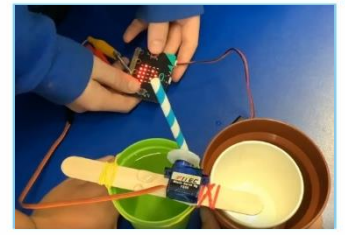
Year 5 Micro:bit Group 2