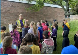
Looking into the past

Here are links to some activities which have been happening in school this week (click on pictures) Check out all of the other galleries showing the children learning and exploring a range of different topics. Check out your child's class page here.