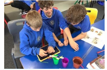
Year 5 Micro:bit