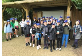
Residential Chester Zoo