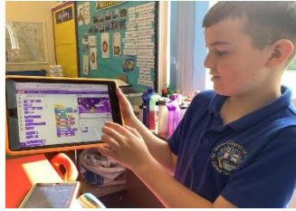
Bassenthwaite – Computing