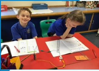
Buttermere – Series Circuits

Here are links to some activities which have been happening in school this week (click on pictures) Check out all of the other galleries showing the children learning and exploring a range of different topics. Check out your child's class page here.