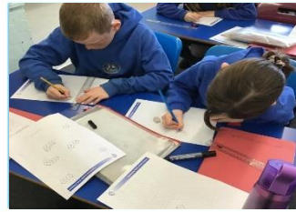
Year 5 Investigate Cubes