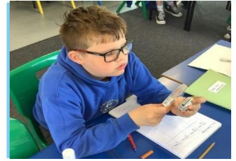
Windermere – Investigating Batteries