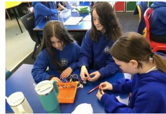
Ullswater Drawing Circuit Diagrams