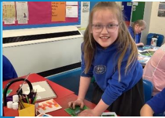
Bassenthwaite Art Week

Here are links to some activities which have been happening in school this week (click on pictures) Check out all of the other galleries showing the children learning and exploring a range of different topics. Check out your child's class page here.