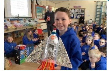
Easter Fair Winners