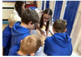
Windermere Transferring Data