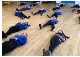
Windermere Mindfulness & Relaxation