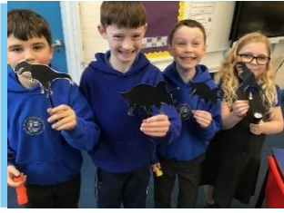
Ennerdale Science Week