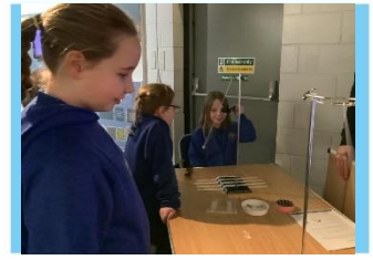
Bassenthwaite Beacon visit for Science Week