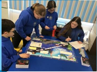
Ullswater RAF Stem Workshop

Here are links to some activities which have been happening in school this week (click on pictures) Check out all of the other galleries showing the children learning and exploring a range of different topics. Check out your child's class page here.