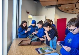
Derwentwater WW2 Beacon visit