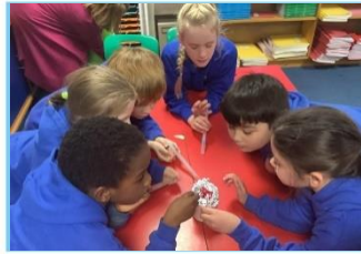
Buttermere Melting Points