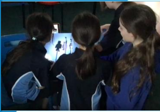
Derwentwater Shadow Puppetry

Here are links to some activities which have been happening in school this week (click on pictures) Check out all of the other galleries showing the children learning and exploring a range of different topics. Check out your child's class page here.