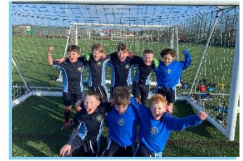
Yr 3 & 4 Lakes College Football Tournament

ROBINWOOD A reminder that we will be hosting a parents and child drop in event on Monday 5th February at 3.20 p.m., in our school hall. During this meeting we will pass on key information on the types of activities we will experience; discuss the kit list and any other the items the children might need for the 3 days and share typical menus and arrangements around laundry, medication and bedding. We will have information for you to share with your children, so that they feel informed and prepared for what has always been a really fun trip. There will be an opportunity to speak to myself or other staff attending the trip afterwards, for those parents who need to ask questions or pass on key information. For those parents unable to attend we will send out the powerpoint afterwards and I'm happy to have a further meeting with any parents if necessary. If children/parents are keen to find out more in the meantime the Barhaugh Hall website is particularly useful.