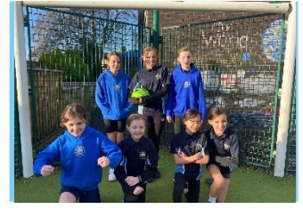
Yr 5 & 6 Lakes College Football Tournament