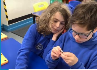
Windermere Brute Force Hackers

Here are links to some activities which have been happening in school this week (click on pictures) Check out all of the other galleries showing the children learning and exploring a range of different topics. Check out your child's class page here.