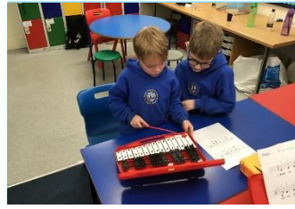
Bassenthwaite Roman Motifs