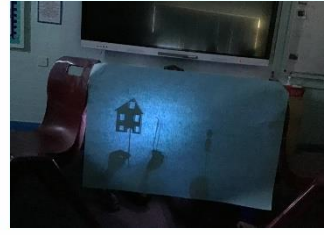
Ullswater How Shadows are formed