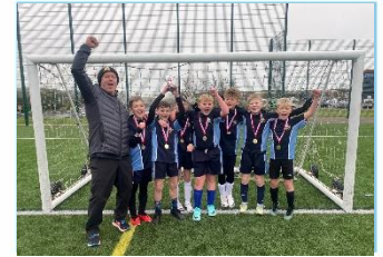
Yr 5 & 6 Lakes College Football Tournament