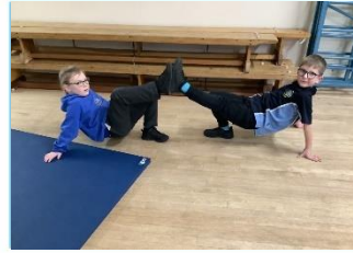
Bassenthwaite Gymnastic Balances