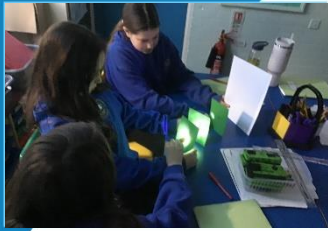
Ullswater Light Travels in Straight Lines

Here are links to some activities which have been happening in school this week (click on pictures) Check out all of the other galleries showing the children learning and exploring a range of different topics. Check out your child's class page here.