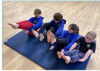
Ennerdale Balances & Body Shapes