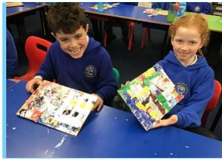
Ennerdale Recycled Art