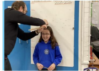
Derwentwater Height Chart