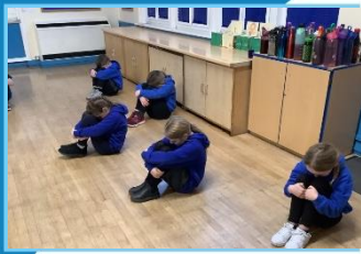
Bassenthwaite Gym Sequences

Here are links to some activities which have been happening in school this week (click on pictures) Check out all of the other galleries showing the children learning and exploring a range of different topics. Check out your child's class page here.