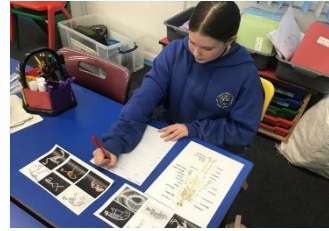
Ullswater Darwin Tree of Life