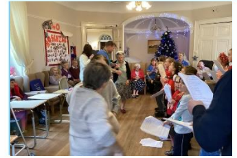
Carol Singing at Rosehill House