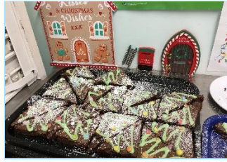
Christmas in the Kitchen