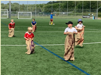
Track Day Events