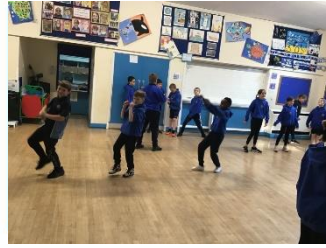
Ullswater Street Dance