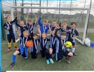
Year 3/4 Mixed Football Festival

Here are links to some activities which have been happening in school this week (click on pictures) Check out all of the other galleries showing the children learning and exploring a range of different topics. Check out your child's class page here.