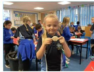
Buttermere Soap Sculptures