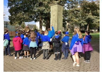
Derwentwater History Walk