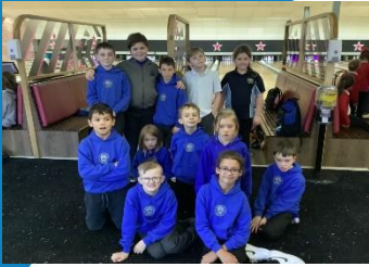
Bowling at Carlisle

Here are links to some activities which have been happening in school this week (click on pictures) Check out all of the other galleries showing the children learning and exploring a range of different topics. Check out your child's class page here.