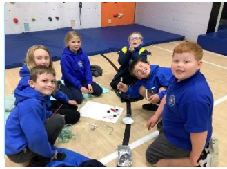
Bassenthwaite visit to WHYP