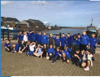
Ennerdale Aquarium visit

Here are links to some activities which have been happening in school this week (click on pictures)