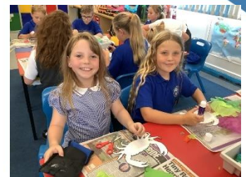
Bassenthwaite - Sea Creature Art