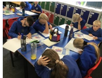
Ullswater – How the heart works