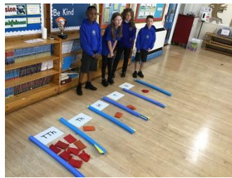
Year 6 Maths