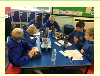
Ullswater — Move Up Day