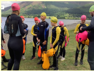
Water Safety at Bassenthwaite Lake

Here are links to some activities which have been happening in school this week (click on pictures) -