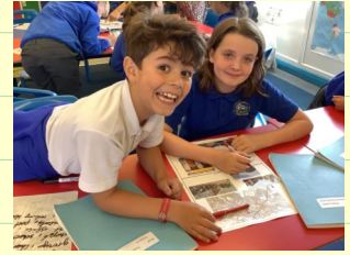
Bassenthwaite - Geography-Settlements

Check out all of the other galleries showing the children learning and exploring a range of different topics. Check out your child's class page here.