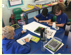
Ullswater — Doodlers