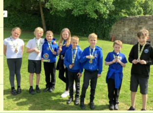
Pantathlon Swim Team