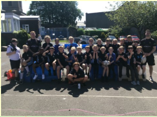
Ullswater—Whitehaven Rugby League Training

Here are links to some activities which have been happening in school this week (click on pictures) -