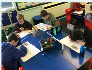
Year 6 Writing a Cyclical Story

Here are links to some activities which have been happening in school this week (click on pictures) -