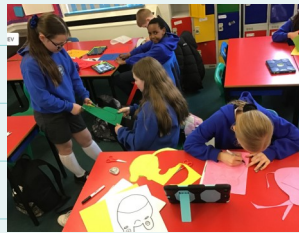
Year 5 Textiles Club