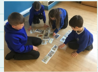
Ennerdale—The Easter Story

Check out all of the other galleries showing the children learning and exploring a range of different topics. Check out your child’s class page here.