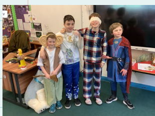
BFG and friends!