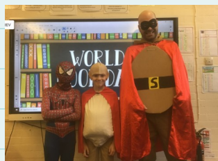
Super potatoes and spiders!