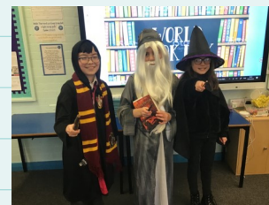
The Wizards of Ullswater!

Check out all of the other galleries showing the children learning and exploring a range of different topics. Check out your child’s class page here.