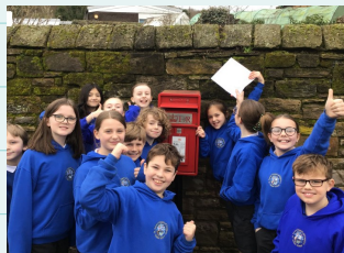
Derwentwater—Letters to the Prime Minister