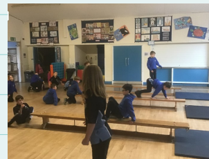
Ennerdale—Gym Fit Circuits

Check out some of the other galleries showing the children learning and exploring a range of different topics. Check out your child's class page here.