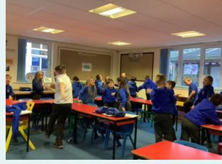
Buttermere— Chinese New Year Music