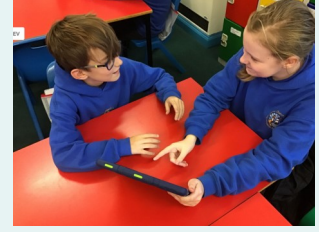
Derwentwater - Computing Search Engines

Check out some of the other galleries showing the children learning and exploring a range of different topics. Check out your child's class page here.